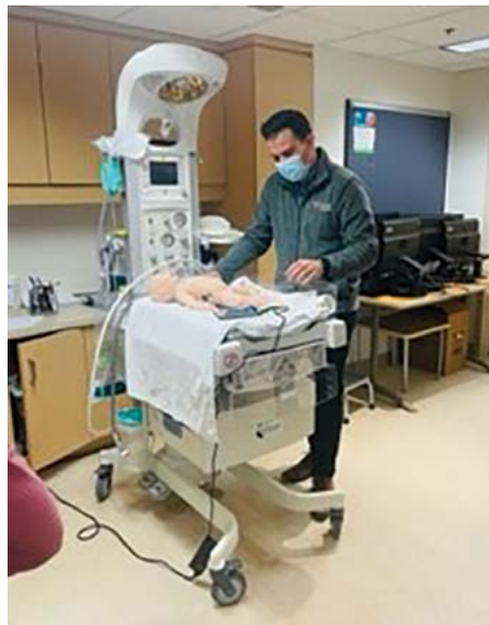
The training manikins offer realistic simulations for the WDMH team.

We are so grateful to our generous donors who are helping to support ongoing learning at WDMH.